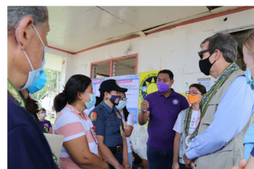
The UN Philippines team for UNCERF MTR mission met with multidisciplinary team (MDT) organized by UNFPA through Plan International working together so referral mechanisms are established and survivors of abuse have access to immediate support.