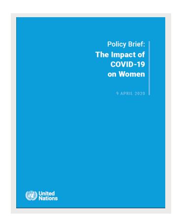
UN Secretary-General's Policy Brief: The Impact of COVID-19 on Women

Other UNFPA technical briefs https://www.unfpa.org/covid19