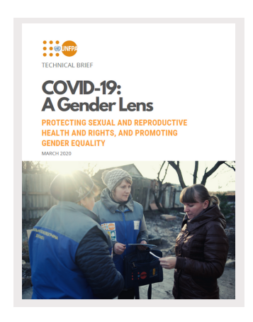
UNFPA COVID-19: A Gender Lens https://bit.ly/UNFPA_COVID19_Gender Lens

Other UNFPA technical briefs https://www.unfpa.org/covid19