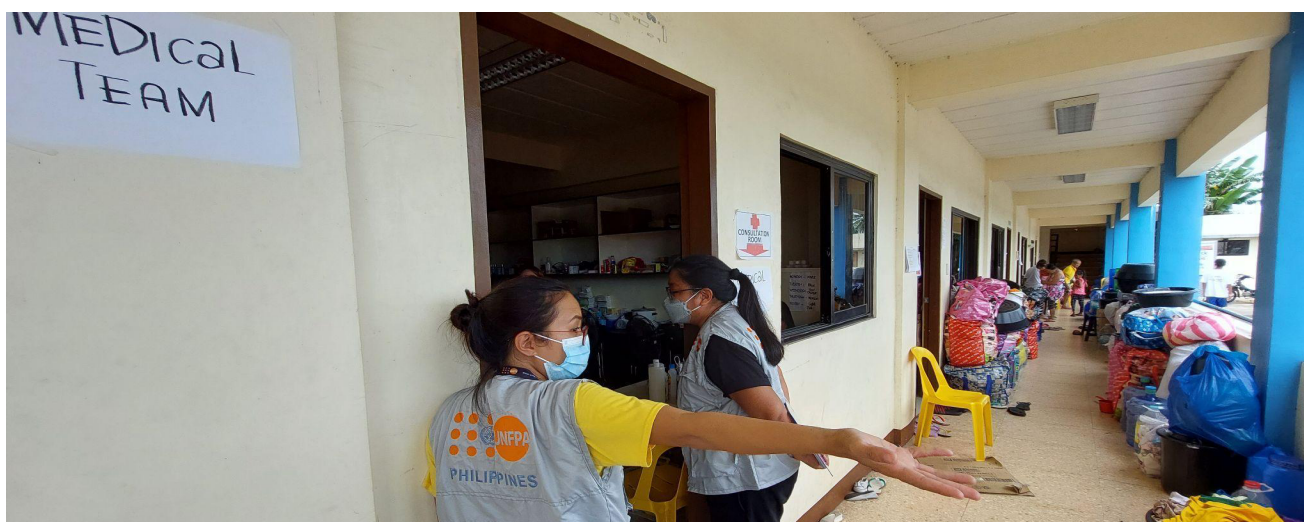
UNFPA field team in Southern Leyte supported a Mental Health and Psychosocial Support (MHPSS) intervention for displaced families affected by Tropical Storm Agaton in April 27, 2022

The Commission on Election (COMELEC) issued a resolution on the prohibition of any public official or employee to release, disburse or expend public funds, effective March 25, 2022 until May 8, 2022. This prevented government agencies from directly disbursing cash, food, and material assistance to survivors of GBV, especially at crisis centers. The GBV Sub-Cluster, working with the Protection Cluster, continued its advocacy for the principles of Centrality of Protection, Do No Harm and Accountability to Affected Populations (AAP).